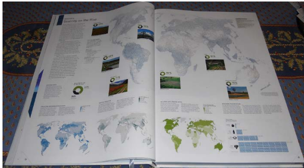
Figure 17.1. National Geographic atlas page showing maps, diagrams and photographs.

package to learn more about your own town? For example, you could combine some population census data with a base map from your national mapping agency to see where the younger people live (perhaps they live close to schools) or where only few people live (perhaps not so many people live close to factories and industrial estates).